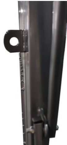
Lock Hasps Detail

RECORD OF REVISION CHANGES TO THIS DOCUMENT ARE LOCATED ON THE LAST PAGE