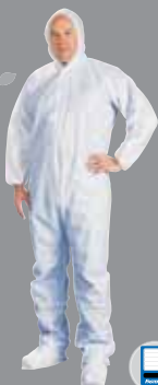
Elastic Back and Wrists / Storm Flap / Hood