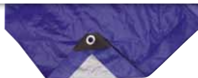
ROCK RIVER™ BLUE/SILVER GENERAL DUTY REVERSIBLE TARP W/ CORNER PATCH

Part No. 1038838 (8'x10') Part No. 1038839 (10'x12') Part No. 1038841 (15'x20') Part No. 1038842 (20'x30') Part No. 1038843 (25'x40') Part No. 1038844 (30'x40')