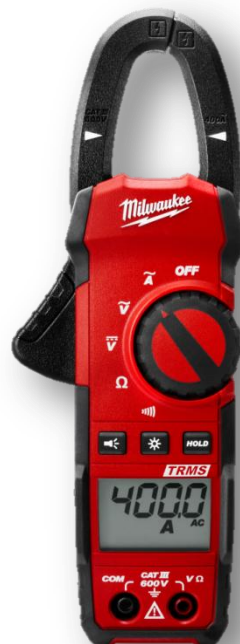
2217-20 Multimeter Fastenal Part # 0748608