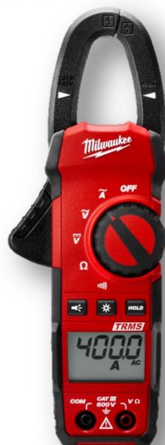
2217-20 Multimeter Fastenal Part # 0748608