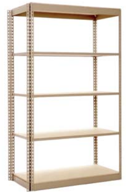
PART NUMBERS DO NOT INCLUDE PARTICLE BOARD SHELVES.