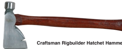
Craftsman Rigbuilder Hatchet Hammer