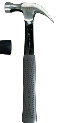
Craftsman Steel Claw Hammer