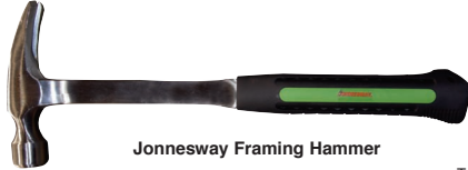
Jonnesway Framing Hammer

Claw/Rip, Masonry, Framing, Shingling, and Hatchet Hammers