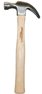
Jonnesway Hickory Hammers