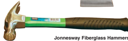
Jonnesway Fiberglass Hammers