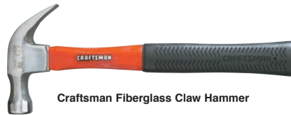
Craftsman Fiberglass Claw Hammer